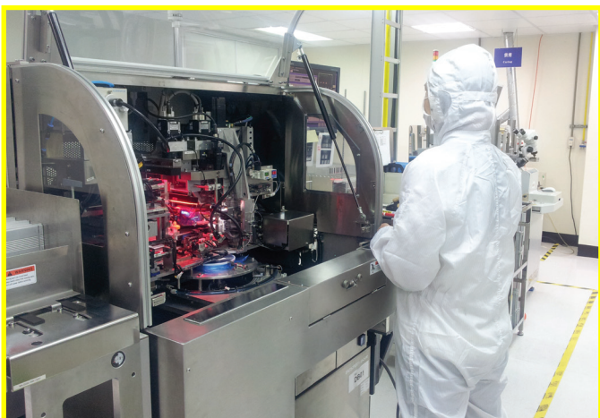
CotoMOS® Class 10,000 Cleanroom Environment for Manufacturing

Coto Technology's reed relay & reed switch manufacturing facility is located in Mexicali, Mexico. Coto Technology, Inc. originated in Providence, Rhode Island, USA in 1917 as Coto Coil Incorporated - a company specializing in the design and manufacture of coil windings. During the mid-1960's, Coto expanded its product line by introducing the reed relay - the result of integrating reed switches into coil windings. By 1970, Coto emerged as a leading manufacturer of reed relays with the development of the first patented Low-Thermal EMF reed relay.